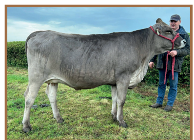
Reserve Hon Mention Champion